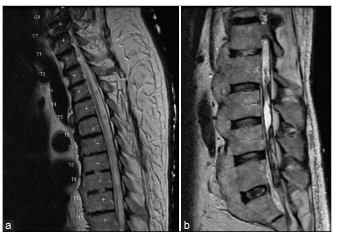
Figure I:(a) Sagittal magnetic resonance imaging of thoracic spine demonstrating noncommunicating syringx. (b) Sagittal magnetic resonance imaging of lumbar spine demonstrating irregular enhancement around dural structures

Cases of AO are exceedingly rare and the full extent of these lesions should be documented utilizing CT.<sup>[5]</sup> MR, however, should also be performed to search for any associated syringomyelia. Good results have been achieved by treating AO with noncommunicating syringomyelia with laminectomy accompanied by decompression/excision of ossified tissue and shunt placement in the conus.<sup>[4]</sup>