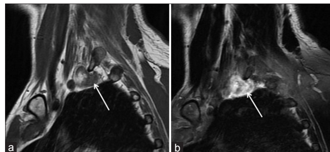
Figure 1: Magnetic resonance imaging of the left brachial plexus demonstrating a heterogeneous T1-hyperintense (a), homogeneously enhancing (b) well-circumscribed lesion located in the posterior brachial plexus (white arrows)

A 31-year-old female presented with a 3-month history, following a motor vehicle accident, of persistent pain along the left medial elbow, accompanied by tingling and numbness in her left fourth and fifth digits and left hand abduction weakness. The neurological findings were suggestive of a C8/T1 radiculopathy or a brachial plexopathy. The brachial plexus MR imaging demonstrated a T1 hypointense, T2 hyperintense,