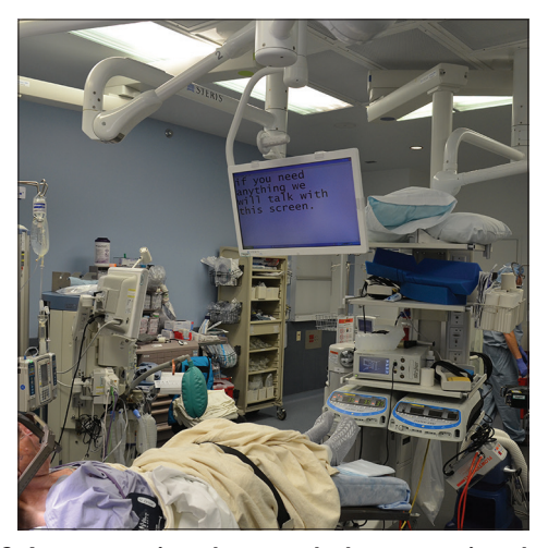
Figure 2: Intraoperative photograph demonstrating the use of a computer monitor to communicate with the patient that has sensorineural hearing loss during DBS surgery

and 25 mm length sterile guide tube (Alpha Omega, Nazareth, Israel) was inserted to a depth of 15 mm above target. Microelectrode recording ensued at this time. The leads (model 3389, Medtronic, Inc., Minneapolis, Minnesota) were subsequently assembled and advanced to target. iCT images were obtained and computationally merged with the preoperative CT [Figure 3]. Target accuracy was measured by recording the x, y, and z coordinates at the center of the lead's most distal contact. The Euclidean distance from the intended target was calculated using the formula \sqrt{||\Delta x|^2 + |\Delta y|^2 + |\Delta z|^2|} [Table 1]. The distal ends of the DBS leads were coiled and tunneled to a pocket created contralateral (left side) to the cochlear implant.