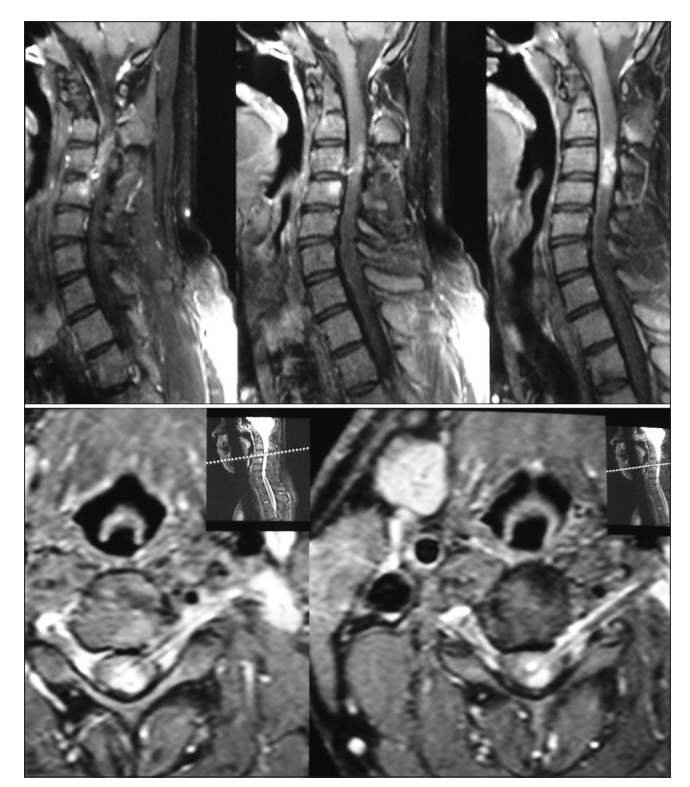
Figure 2: Magnetic resonance imaging showing gadolinium enhancement of the spinal cord