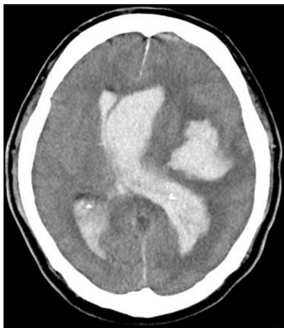
Figure 1: A computed tomography image on admission showing massive left intracerebral hemorrhage

Cranioplasty is performed not only to address the cosmetic problem but also to improve the neurological