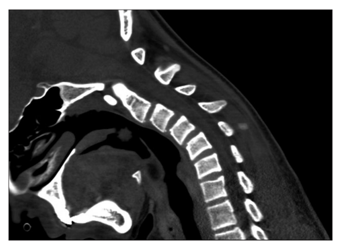
Figure 2: Sagittal reconstruction of CT image showing cervical kyphosis and narrowing of the cervical spinal canal