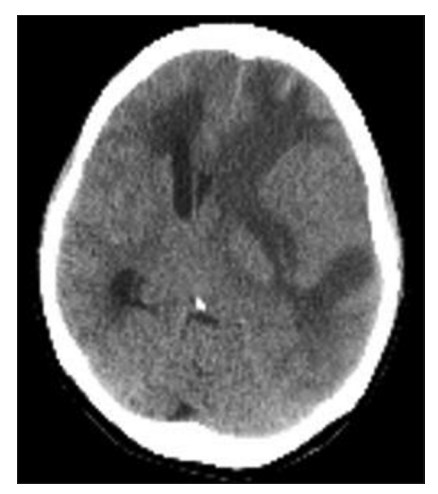
Figure 1: CT Brain without contrast demonstrating 4 \times 3 \times 3 cm left frontal temporal mass with significant surrounding vasogenic edema, associated with mass effect/near complete effacement of the left lateral ventricle and rightward midline shift of approximately 1 cm