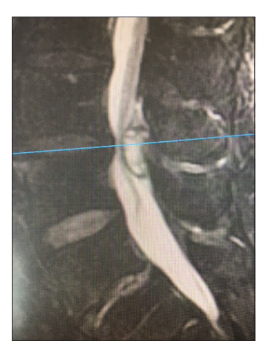
Figure 2: The midline sagittal T2-weighted MR demonstrated a hyperintense/somewhat heterogeneous mass consistent with coalescence of bilateral synovial cysts filling the dorsal spinal canal at the L3-L4 level. Note that at surgery, the coalesced synovial cysts extended all the way to the L2-L3 level

Synovial cysts typically have tough, firm, thick, and often ossified/calcified capsules containing gelatinous/crank case fluid or fibrous material (e.g. rather thn fluid) that can be readily aspirated.<sup>[2-4]</sup> In a review by Epstein