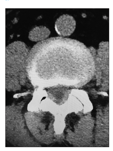
Figure 3:The axial soft tissue CT showed marked stenosis attributed to bilateral OYL and massive calcified capsules of the bilateral synovial cysts at the L3-L4 level. Note the air within the right L3-L4 facet joint

et al., attempts at aspiration reportely fail in 50–100% of the cases. <sup>[2,3]</sup> In 2017, when Lutz et al. attempted 35 lumbar synovial cyst ruptures, 40% required repeated cyst rupture, and 31% needed surgery. <sup>[5]</sup>