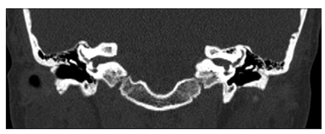
Figure 1: Coronal view showing the exostosis in the internal auditory canal. The red circle shows how the left is severely narrowed as compared to the right

Surgery was performed in lateral position, with the left side up [Video 1]. A spinal drain was placed to aid with brain relaxation. A curvilinear incision was made behind the ear for a retromastoid approach. A standard suboccipital craniectomy was fashioned. The cisterna magna was decompressed by allowing cerebrospinal fluid to drain through the spinal drain. The brain was retracted medial and inferior to the seventh and eighth cranial nerve complex. After splitting the arachnoid, the exostoses were visible on the base of the porus acousticus below the anterior inferior cerebellar artery and appeared to be directly compressing the intermediate nerve. At this point, with the assistance of the neurotologic surgeon, the bone was drilled with a series of diamond drills until it was flat. Thereafter, Teflon was laid between the bone and the seventh and eight cranial nerve complexes. Intraoperative monitoring