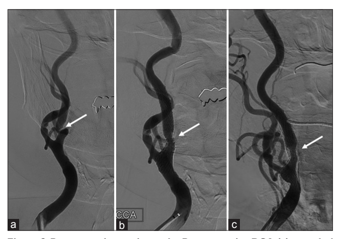
Figure 2: Postoperative angiography. Postoperative DSA (a) revealed kinking stenosis of the right ICA (white arrow). CAS was performed, and the stenotic lesion was improved (b). Restenosis did not occur as of 19 months after CAS (c)