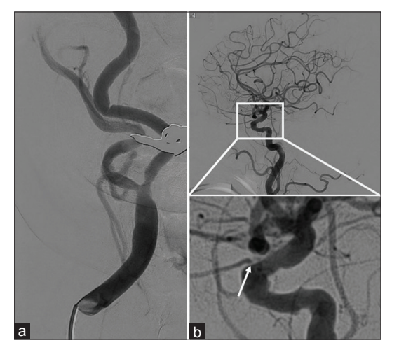
Figure 1: Preoperative carotid angiography. Anterior-posterior (a) view on preoperative carotid angiography showing moderate stenosis of the right ICA. The origin of the right ophthalmic artery was stenotic (white arrow), and blood flow was delayed (b)

It was also reported by Yuan et al. that a kinking stenosis with hemodynamically significant PSV (>120 cm/s) on intraoperative duplex ultrasonography should be repaired.<sup>[10]</sup> Based on this indication, 11 of their 285 cases (3.9%) were repaired using a synthetic patch, and none of these experienced strokes because of kinking. They also reported that 16 patients with kinking stenosis and nonhemodynamically significant PSV (<120 cm/s), and who only underwent direct primary closure, remained asymptomatic throughout their 24-month follow-up period. The degree of vessel stenosis in these cases improved naturally by 4–8 months after surgery in two patients. We also experienced spontaneous improvement in such patients [Figure 3]. Here, we expected the