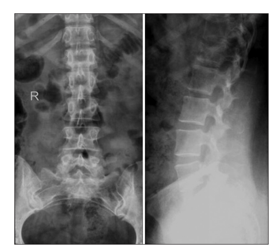
Figure I: Preoperative X-ray of the patient showing Stable burst fracture of L1 vertebra with local kyphosis