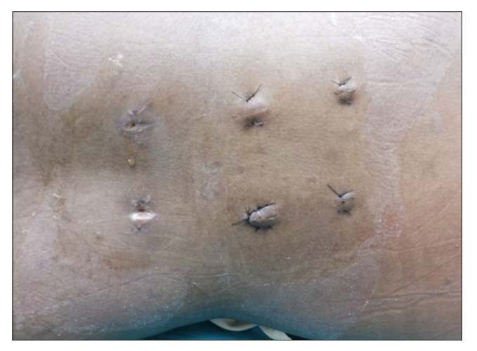
Figure 4: Clinical picture during the wound wash showing serous discharge on tenth postoperative day

Acute compartment syndrome involving the paraspinal muscles has been reported in various settings including trauma, surgery, and non-traumatic situations.<sup>[2,3,5,6]</sup> However, it is very rare the compartment syndromes involve the paraspinal musculature after minimally invasive TL spine surgery. The posterior TL spinal muscles, enclosed by the thoracolumbodorsal fascia, form a potential space for the development of a