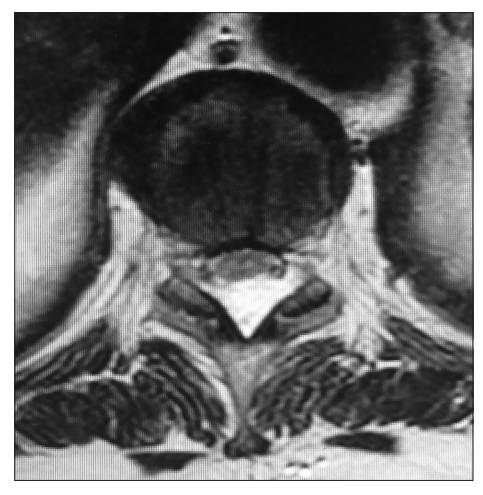
Figure 3: T2-weighted axial MRI enhanced with gadolinium showing a mass occupying the spinal canal with discrete compression of the dural sac