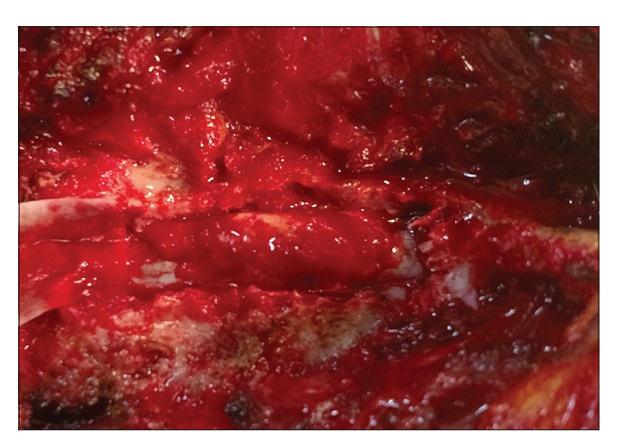
Figure 4: Intraoperative photograph showing the red-purple, hemorrhagic epidural lesion (black arrows) after laminectomy from T9 to T11