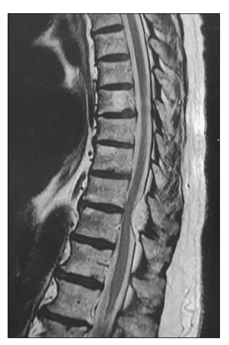
Figure 1:T2- weighted contrasted MRI of the spine, sagittal view, showing a hyperintense lesion in the epidural space of the thoracic spine, with discrete spinal compression at the T9 and T10 levels

Under fluoroscopic guidance a T9-T11 laminectomy revealed a reddish highly vascularized soft lesion easily dissected away from the dura; a total en bloc excision was achieved without a dural fistula [Figure 4]. Postoperatively, the patient could ambulate without assistance and had no neurological deficits. She was discharged three days later without further complications.