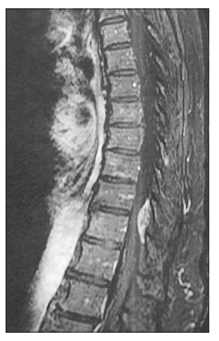
Figure 2: Fat-suppressed TI-weighted MRI of the spine, sagittal view, after administration of gadolinium showing a well-circumscribed enhancing lesion causing displacement of the spinal cord at the T9 and TI0 levels

Capillary hemangiomas are ubiquitous hamartomatous malformations resulting from the proliferation of vascular endothelial cells. Their histopathological characteristics include thin irregular capillary-sized vessels captured in fibrous low attenuating, lobular architecture, and the presence of a continuous basal lamina coating.<sup>[5,6]</sup> Capillary hemangiomas are usually found in the skin