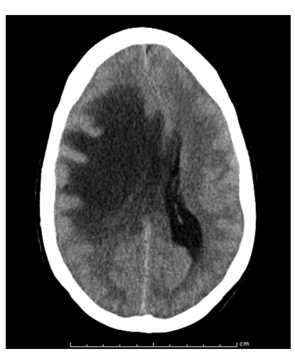
Figure 3: Axial computed tomographic image showing aggressive development of edema causing transtentorial herniation

Treatment of tumefactive lesions is generally challenging and recovery is often incomplete. Treatment choices include IV methylprednisolone, \beta -interferons, plasma exchange, rituximab, and natalizumab (monoclonal