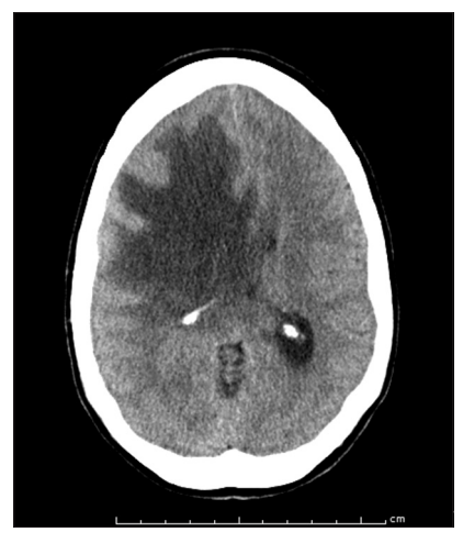
Figure 2:Axial computed tomographic image obtained at the time of admission, before high-dose steroid therapy was started, showing subfalcine herniation

thought to be 0.3 cases per 100,000 patients per year.<sup>[16]</sup> There is no clear gender predilection for tumefactive lesions. Patients in their 20s and 30s are most likely to be affected, although cases involving pediatric and older patients have also been described.<sup>[15]</sup> These lesions are typically larger than 2 cm in diameter and usually cause considerable edema and mass effect.[1,6,18,20] They are commonly seen as ring-enhancing lesion<sup>[3,6]</sup> which makes their diagnosis challenging because tumors and infections have a similar appearance on MR imaging. An open ring-enhancing lesion is almost pathognomonic for MS and affected patients can frequently present with localized neurological deficits, such as hemiparesis, aphasia, ataxia, headaches, and seizures. The ring enhancement is thought to be an advancing area of active inflammation away from a central and more chronic nonenhancing core.<sup>[8]</sup> Histologically active lesions consist of areas of demyelination with hypercellularity and reactive astrocytes that may contain multiple nuclei (Creutzfeldt cells) closely intermingled with myelin-containing foamy macrophages.<sup>[15]</sup>