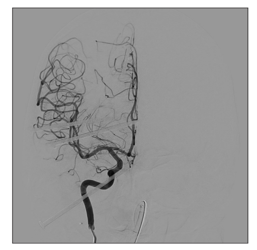
Figure 7: Nails and their relation to major cerebral arteries

The nail was extracted in a controlled manner by a second surgeon, under direct visualization. Removal required significant force, with some torsion. With the aid of direct observation, it was possible to confirm no new hemorrhage during extraction, and that vital structures could be protected. The defects in the brain stem and petrous temporal bone left by the nail were covered with floseal and surgicell. Standard closure was achieved.