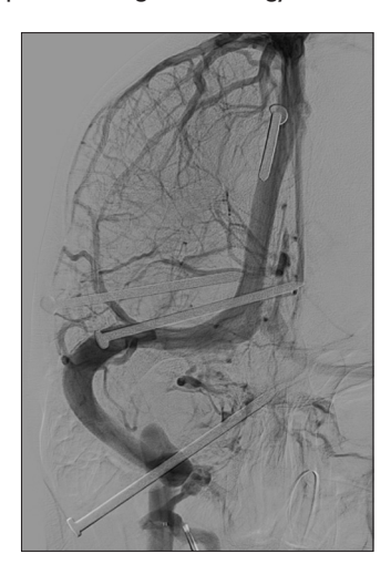
Figure 6: Nail involving right internal jugular vein