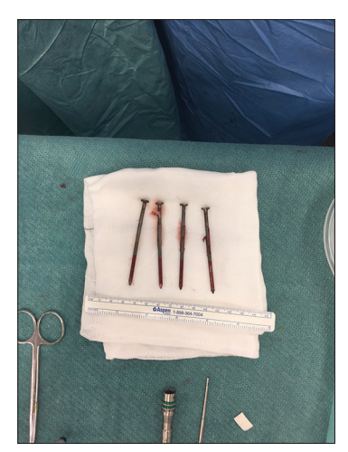
Figure 10: Nails after removal from skull. Ruler for reference