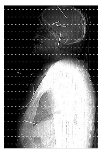
Figure 2: Localizer CT image showing location of nails, including in pericardium