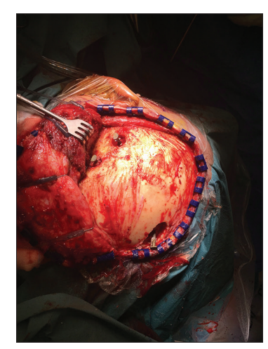
Figure 9: Exposure prior to removal of the three skull vault nails