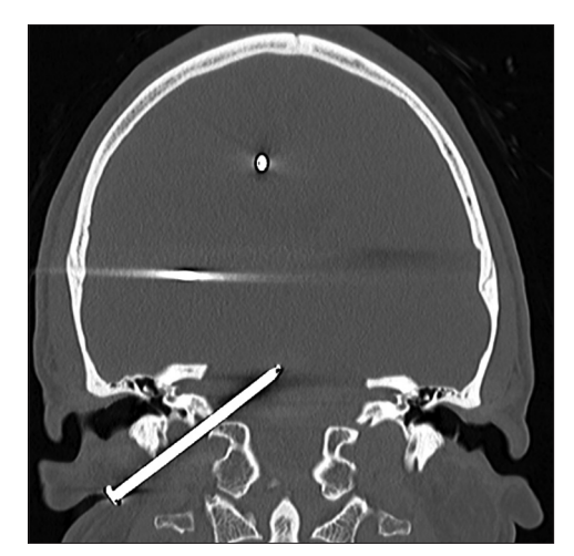
Figure 5: Nail through right jugular foramen