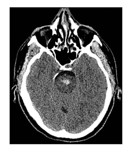
Figure 4: CT showing hematoma within pons at tip of nail