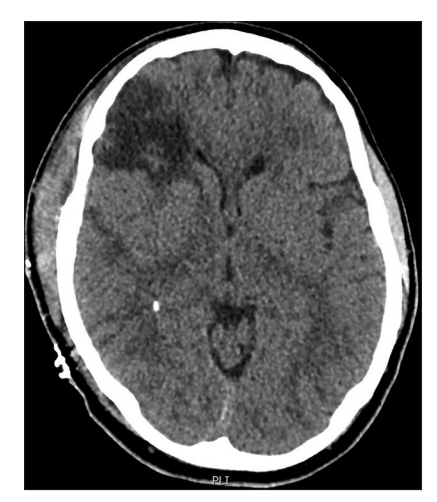
Figure 12: Area of ischemia

been missed, and the odds of catastrophic bleeding intraoperatively would have been significantly higher and difficult to control. The temporal nails missed the major arteries of the sylvian fissure. The final nail abutted the sagittal sinus but injury could occur during extraction.