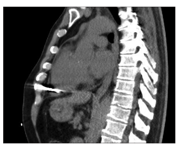
Figure 3: CT showing pericardial nail