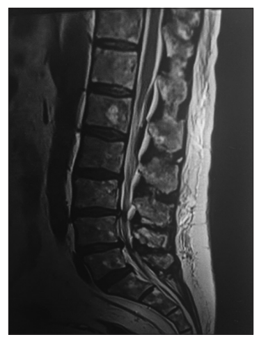
Figure 3: Control sagittal T2-weighted magnetic resonance showing partial resorption of the hematoma.

A prospective study at the Twin Cities Spine Center, Minneapolis, MN, USA, (2008) showed that lumbar decompression surgery results in a 58% incidence of asymptomatic compressive postoperative epidural hematoma (POEH). Adjacent level compression by POEH occurs in 28% of patients. Advanced