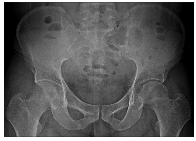
Figure 4: (Case 2) Initial anteroposterior X-ray showing normal hip ioints.