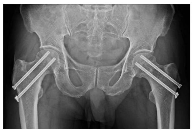
Figure 3: (Case 1) Postoperative anteroposterior X-ray of both hip joints showing cannulated cancellous screw fixation of both the femoral necks.

As demonstrated in the two cases presented, X-rays alone may have "missed" hip pathology. In both cases, hip fractures