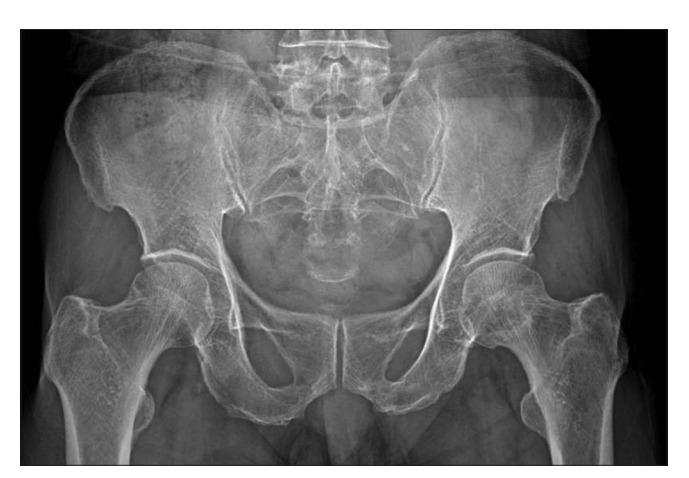
Figure 1: (Case 1) Preoperative anteroposterior X-ray of pelvis with both hips showing normal hip joint and femoral necks.

A 35-year-old male patient presented with low backache and right hip pain (VAS 7) of 1 month's duration following an insignificant traumatic event. Straight leg raising test was