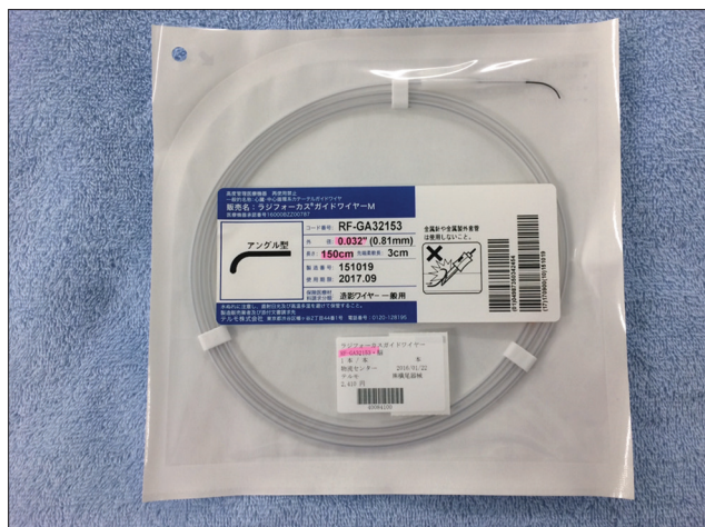
Figure 1: A guidewire used in this method (Radifocus, Terumo, Tokyo, Japan). The size of tip, 0.81 mm in diameter, fits for spinal catheter of Codman Hakim programmable valve

tip of the guidewire should be stopped at the distal end of the spinal catheter. In this condition, the spinal catheter is able to be pushed back manually. Under the fluoroscope imaging, the catheter was replaced into the appropriate position. After the replacement of the catheter, the guidewire is removed. Then, the smooth CSF outflow is reconfirmed.