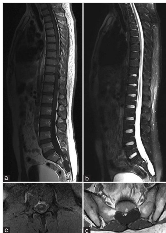
Figure 1: Preoperative (a) T1 and (b) T2-weighted sagittal magnetic resonance imaging (MRI) showing mixed signal abnormalities representing syringomyelia with septations extending from T12 to S1 levels, alongside cord tethering and thickening of the filum terminale at the S2 level. Another signal abnormality seen at S2-3 level causing scalloping of the vertebral bodies – isointense on T1 (a) and hyperintense on T2 (b), representing a Tarlov cyst. T1-weighted axial cuts at the L3-4 level (c) highlighting contrast enhancement of a solid component with gadolinium and enlargement of the spinal canal at the S2 level by the Tarlov cyst (d)

In the absence of any history of spinal dysraphism, adults presenting with TCS are rare. MRI demonstrates a thickened, posteriorly displaced filum terminale (>2 mm), often with a low lying conus usually below the L2 vertebral body. [5] Early and aggressive surgical intervention is recommended in symptomatic patients, owing to 80% improvement in pain, 60% improvement