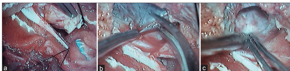
Figure 3: (a) Represents the thickened filum terminale observed after S1-2 laminectomy, which was divided to untether the cord. (b) The picture shows the relation of the Tarlov cyst with the durotomy (proximal) done for un-tethering. (c) Represents the fenestration of the Tarlov cyst with evacuation of fluid and partial removal of the cyst wall

in motor deficits, and 50% tendency for improvement in sensory and urinary symptoms. [2]