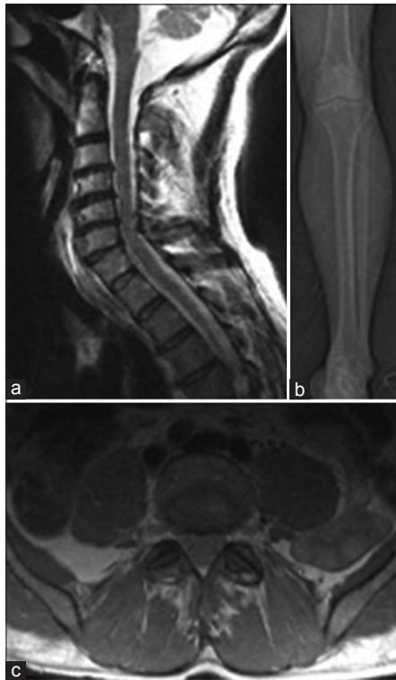
Figure 1: (a) Sagittal T2-weighted magnetic resonance imaging (MRI) showing degenerative spondylosis without significant cord compression. (b) Computed tomography scout image of left leg demonstrating fibular head without evidence of fracture. (c) Axial proton-density-weighted turbo spin echo MRI showing the L5 nerve roots exiting the spinal canal, no foraminal stenosis, or disc herniation

A 55-year-old male was mountain biking and fell 15 feet, hitting his head and losing consciousness. Neurologic examination of the left leg revealed MRC