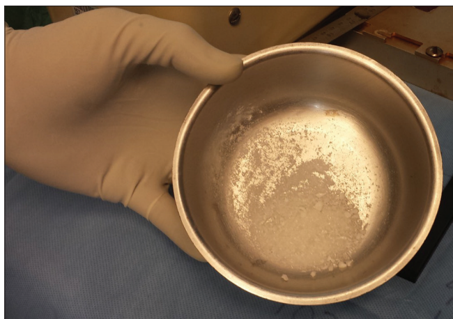
Figure 1: Vancomycin powder before placement into a cranial wound