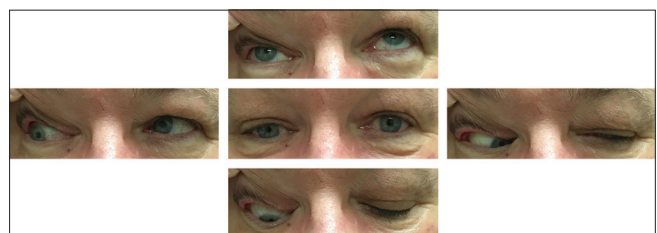
Figure 3: Photographs demonstrating resolution of the third nerve palsy 4 months after epidural spinal injection. The center panel demonstrates the position of the eye at rest. Remaining images demonstrate eye position during voluntary gaze in each direction relative to the center panel

mononeuropathies. [8] Finally, although mild anisocoria was observed in association with ophthalmoplegia in this case, vascular imaging was negative for an aneurysmal or other compressive sources. Jacobson et al. [5] reported a 38% incidence of pupillary involvement in 26 patients with diabetic third nerve palsy, whereas other retrospective series estimated pupillary involvement in 14–32% of patients. [2,4]