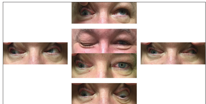
Figure 1: Photographs demonstrating ophthalmoplegia secondary to the right third nerve palsy with involvement of the pupil. The center panel demonstrates the extent of ptosis at rest and characteristic “down and out” position of the eye. Remaining images demonstrate eye position during voluntary gaze in each direction relative to the center panel

Diabetes-associated oculomotor palsy affects ~0.5% of all diabetic patients and accounts for 11–42% of all third nerve palsies. [6,7,10] The predominant etiology underlying oculomotor mononeuropathy in these patients is microvascular ischemia. Older patients with long-standing glucose intolerance and poor glycemic control are particularly susceptible, [10] as are patients with concurrent diabetic retinopathy or those with multiple cardiovascular risk factors. [3] This patient's known vasculopathic risk factors and transient ESI-induced hyperglycemia likely precipitated his third nerve palsy. In addition, his deficit resolved over 4 months, in line with the typical 2 weeks to 9 months expected for resolution of diabetic