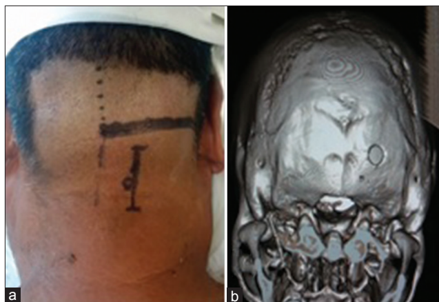
Figure 2: (a) The surgical planning with the vascular anatomic structures in the posterior fossa. (b) 3D reconstruction of CT scan with burr hole at the occipital bone