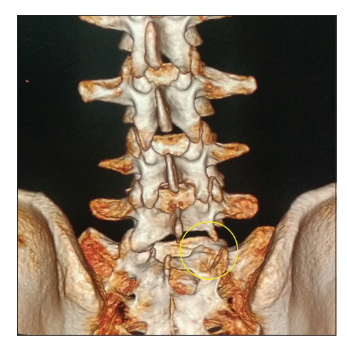
Figure 4: Computed tomography scan 3D reconstruction shows agenesis of the L5 inferior articular process on the left side.