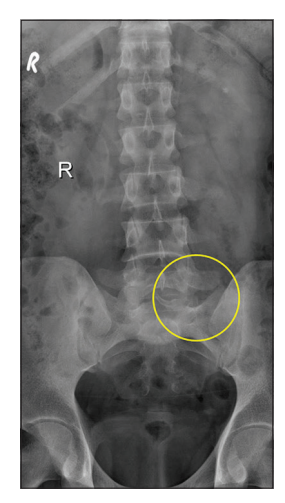
Figure 1: Anteroposterior X-ray image showing the absence of the left L5–S1 zygapophyseal joint.