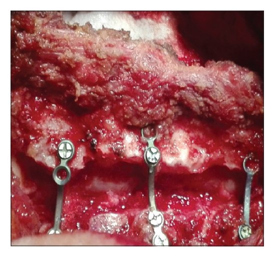
Figure 1: Open door laminoplasty technique.

*Wilcoxon matched-pairs signed ranks test. JOA: Japanese orthopedic association; VAS: Visual analog scale