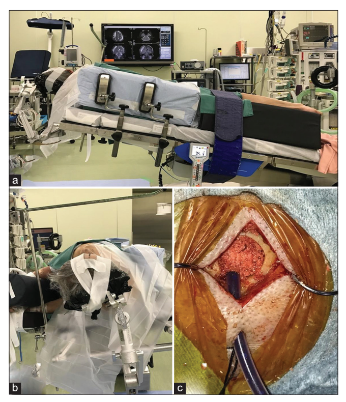
Figure 1: Surgical procedure for burr hole drainage without irrigation. (a) The patient is placed in the lateral position, (b) the head is fixed within the head holder, and the burr hole is positioned at the highest point of the operative field, (c) the drainage tube is inserted at a depth of 3 cm into the hematoma cavity, and the burr hole is filled with bone dust and a cellulose sponge.

The patient was placed in the lateral position with the head fixed on a horseshoe-shaped pillow, provided that the burr hole site was at the highest point [Figure 1a and b], after sedation with intravenous administration of midazolam (0.06-0.08 mg/kg body weight). A 3-4 cm linear skin incision was made around the proposed burr hole site in the cephalocaudal direction, under local anesthesia (lidocaine 1% with epinephrine). The burr hole was completed following subperiosteal dissection. Immediately after resection of the outer membrane of the hematoma, a 5 L ventricular drainage tube was inserted 3 cm deep into the hematoma cavity. The drain was subcutaneous and secured to the skin, 1 cm cranial to the wound edge. Neither irrigation nor suction was performed. Oxidized cellulose (Gelfoam, Pfizer, New York, NY, USA) was placed over the surgical site and the bone fragments that were collected during burr hole drilling were used to fill the burr hole [Figure 1c]. The patient was repositioned in cases with