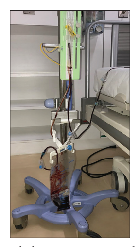
Figure 2: Semi-closed drainage system used at the ward. The external auditory meatus is used as a reference for height.

The risk factors for recurrence (i.e., age, sex, preoperative MRI findings, the presence or absence of preoperative antithrombotic therapy, hematoma drainage rate, and hematoma bilaterality) were evaluated using the Chi-squared test for sex, nonhyperintense lesions on T1WI, the presence or absence of septa, the presence or absence of preoperative antithrombotic therapy, hematoma drainage rate of <50%, and hematoma bilaterality, or the Mann–Whitney U-test for age and preoperative hematoma volume using SPSS (SPSS inc., Chicago, IL, USA).