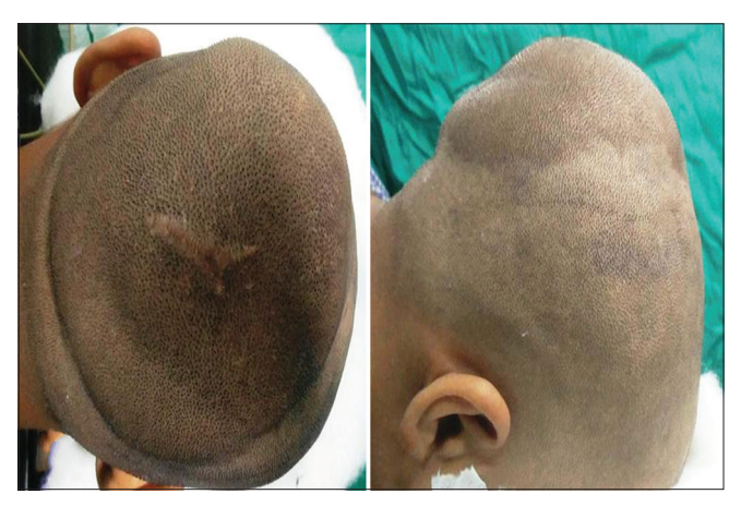
Figure 1: Clinical photograph displaying scalp swelling with overlying brownish skin discoloration.

A calvarial defect is usually not associated with neurofibroma in the absence of syndromic association. Skull defect having sclerotic margins is suggestive of an underlying neurogenic tumor.<sup>[1]</sup> In this patient, small cranial defect was seen on radiology. Intraoperatively, we found that the cranial defect margins were smooth and were not involved. Hence, bone around the defect was not drilled. There are only few reports of calvarial defects in association with neurofibromatosis in children and young adults in the English literature [Table 1].