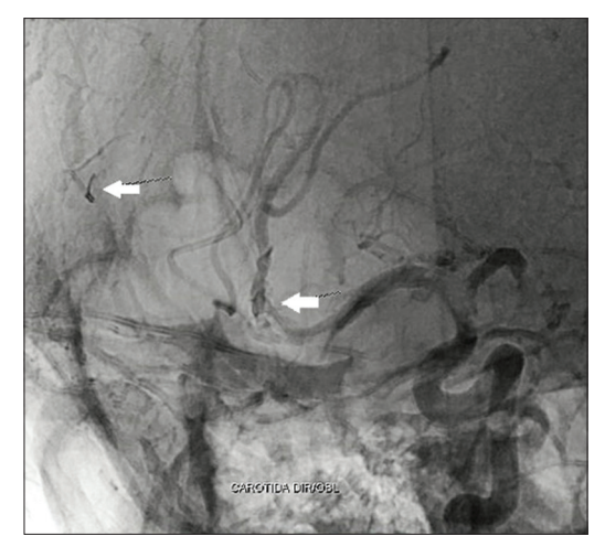
Figure 2: The right carotid angiography (oblique view) showing stent fragments (arrows) that migrated in the right middle cerebral artery.

The asymptomatic carotid trial (ACT-1) carried out by Weinberg et al. <sup>[11]</sup> showed a stent fracture incidence of 5.4%.<sup>[11]</sup> In the group of patients with stent fractures, the lesions were found in or adjacent to the carotid bulb. In this group, the presence of calcification was one of the main risk factors.<sup>[11]</sup> There was no statistical difference regarding primary outcomes (death, stroke, and acute myocardial infarction) between groups with and without stent fractures.