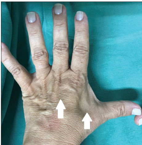
Figure 1: Dorsal view of left hand. Note interosseous muscles atrophy, specially seen between I and II metacarpal bones (white arrow).

A 45-year-old female complained about weakness of the left hand with local pain and sensory loss in the IV, V fingers and hypothenar volar region in the 4 th day of a 500 km road cycling amateur competition. After the end