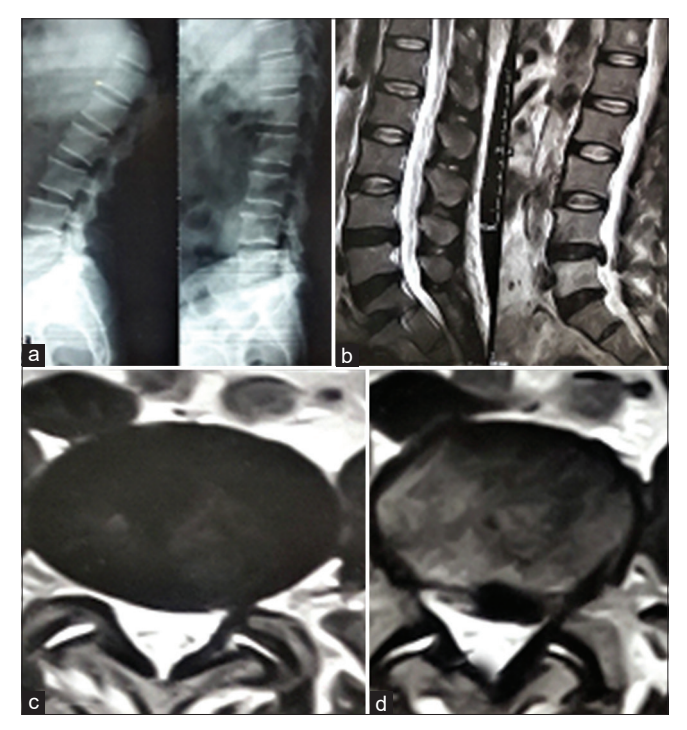
Figure 1: Primary discectomy done on January 11, 2014 at L 4-5 level of 46-year-old man. (a) Dynamic X-ray shows no instability (b), and (c,d) sagittal and axial view of T2W magnetic resonance imaging shows disc herniation.

JOA: Japanese Orthopedic Association, SLRT: Straight leg raising test