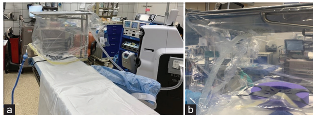
Figure 1: (a and b) Setup of the overhead transparent plastic barrier with powered suction technique .

It is recommended to use a large clear transparent plastic bag, Mayo stand, and large powered suction, covering the head of the bed space [Figure 1]. The intubation procedure and plastic draping were explained fully to the patient who demonstrated good understanding and compliance. Once the patient entered the operating room, his head and upper body were covered [Figure 2]. The face mask or high-flow nasal cannula provided oxygen to the patient. High caliber smoke laser evacuator suction tubing was attached under the top of the Mayo stand, creating a negative pressure environment for the potentially infectious patient’s face and mouth. The assistant worked outside the plastic bag by applying cricoid pressure or jaw thrust while the anesthesiologist intubated the patient. The sealed plastic sac was kept throughout surgery until extubation. This limited the spread of the virus and provided immediate suctioning of the virus in case the patient coughed during an airway manipulation. After use, the drape was easily disposed of into a biohazard container to eliminate further infection risk.