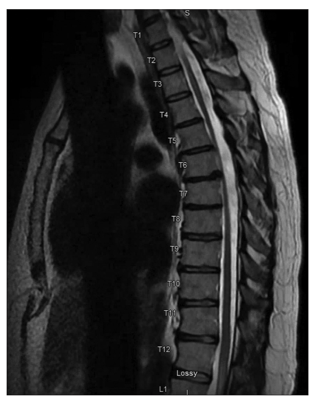
Figure 4: Follow-up sagittal T2-weighted MRI of the thoracic spine at 10 months. Significant improvement in spinal cord edema compared to initial imaging [Figure 2a].

spinal cord as an isolated lesion is rarely described. Spinal cord involvement of histoplasmosis has been described in case reports and series. The Table 1 outlines the available case reports, several of which involved challenging courses with delayed diagnoses.<sup>[1-5,7,9,10]</sup> Only four cases had CNS involvement isolated to the spinal cord.<sup>[2,5,9,10]</sup> Half of the cases reviewed reported an immunocompromised state,<sup>[2,4,5,9]</sup> five of eight reported endemic exposure,<sup>[1,2,4,7,9]</sup> and treatment was variable but all included amphotericin. Our patient's unique clinical course illustrates several valuable learning points.