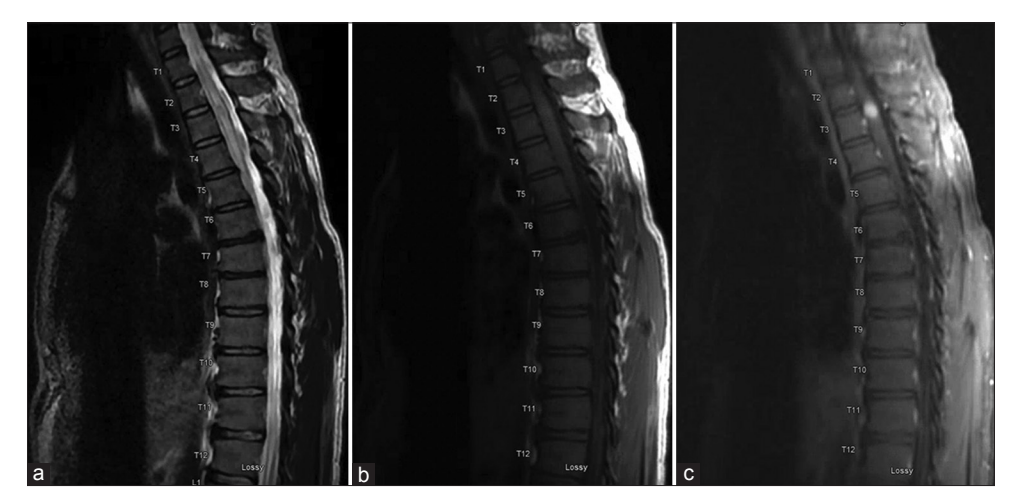
Figure 2: Initial magnetic resonance imaging of the thoracic spine demonstrates a 9-mm homogeneously-enhancing intramedullary spinal cord lesion with significant edema within the spinal cord above and below the lesion. Sagittal T2-weighted image (a), sagittal T1-weighted image without contrast (b), and sagittal T1-weighted image without contrast (c) are shown.

Histoplasmosis is most commonly a self-limited respiratory disease primarily seen in endemic regions. Disseminated disease is primarily seen in immunocompromised hosts and can involve the CNS. CNS involvement limited to the