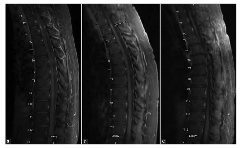
Figure 3: Follow up serial sagittal T1-weighted magnetic resonance imaging of the thoracic spine with contrast – 3 months (a), 6 months (b), and 10 months (c) from initial imaging [Figure 2c] – demonstrate interval regression and ultimate resolution of the enhancing intramedullary spinal cord lesion.