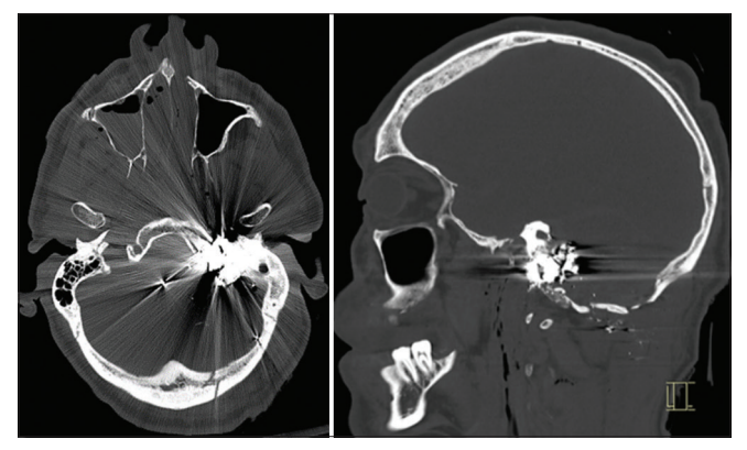
Figure 2: Computer tomography scans of the brain showing the metallic bullet fragment lodged in the jugular foramen.

CT of the chest demonstrated a small metallic fragment within the right ventricle, without any other penetration or associated injuries to the chest or abdomen [Figure 3]. Surrounding structures did not appear injured. Follow-up chest X-ray was performed shortly after the scan confirming the presence of a metallic fragment in the right ventricle,