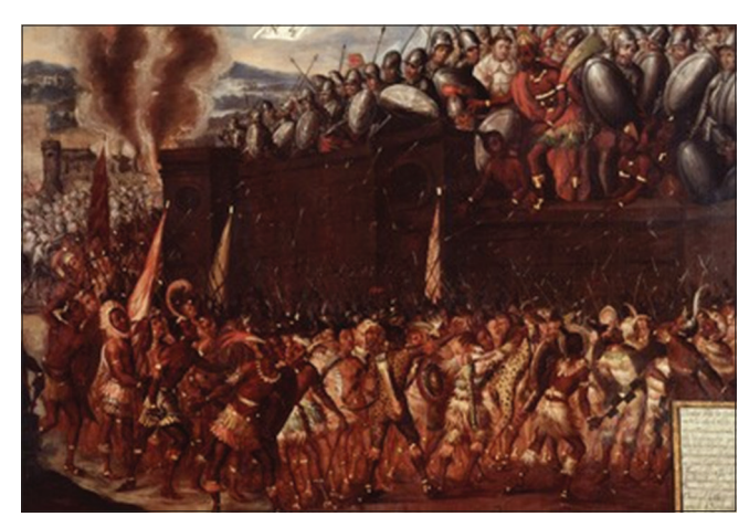
Figure 2: Panoramic view of the perspective of Montezuma II's exit to the balcony of the palace partially guarded by the Spaniards, to express his speech to his people, and the position of the Aztecs in a furious and angry posture. Source: "The death of Montezuma at the hands of his own people" Library of Congress. Washington D.C. USA. Open access to historical paintings and public domain.

Information about the history of the fall of the Aztec empire diverges between two versions, the first one where the death of Montezuma is attributed to the Indians, told by Spaniards such