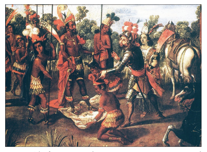
Figure 1: The first encounter between Emperor Montezuma II and Hernan Cortés in México (Tenochtitlan), today Mexico City on November 8, 1519.

On November 8, 1519, the first meeting between Montezuma II and Hernan Cortés (the Spanish conqueror) took place,