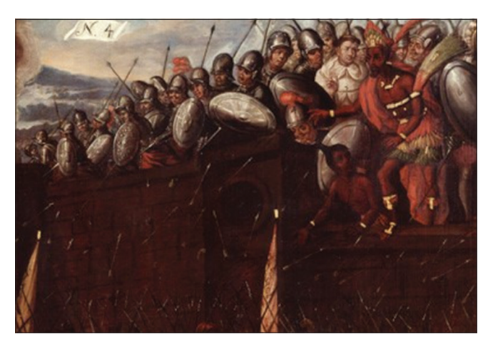
Figure 3: A coercive posture of Emperor Montezuma in front of the crowd. Observe the position of the arrows in a kinetic attack on the group located on the balcony.