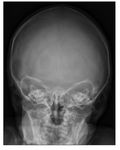
Figure 2: Posterior-anterior skull radiograph obtained at 7 weeks of age demonstrating metopic suture synostosis.