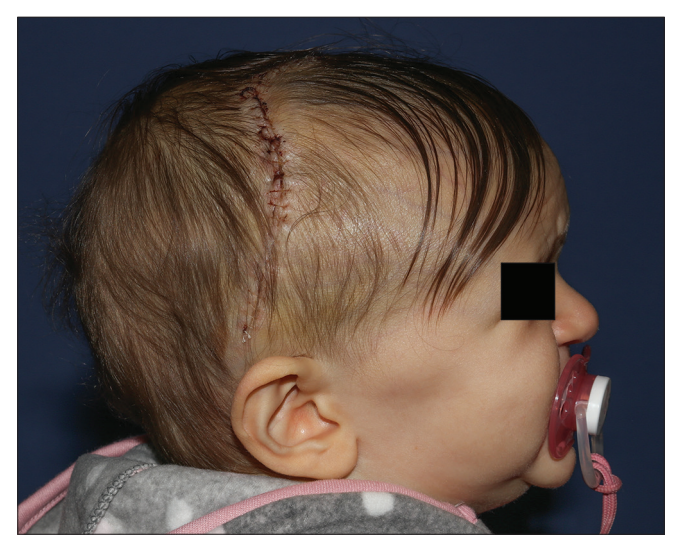
Figure 5: Right side profile view showing adequate wound healing at postoperative day 7.

The patient followed up 3 days later (postoperative day 7) displaying adequate head shape and good wound healing. Her scalp incision appeared well approximated with no signs of infection or dehiscence [Figure 5]. At 4 week follow-up, the patient was noted to have a small area of dehiscence at the right scalp incision. There was no active infection and wound care was stressed to the patient's parents in hopes of secondary wound healing. The patient presented 1 month later for follow-up and was noted to have a 2 cm \times 2 cm area of ulcerated skin at the lateral aspect of the right scalp flap [Figure 6]. Again, this did not appear to be actively infected, but was failing to heal. The patient was taken to the operating room for wound debridement and scalp closure, after which the wound healed well without further complication.