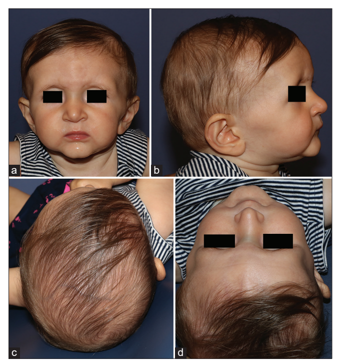
Figure 1: Frontal (a), side profile (b), bird's-eye view (c), and modified bird's-eye views (d) of the patient displaying a pointed and prominent menton, ridging of the supraorbital rims, mild metopic ridging, hypotelorism, and relative bitemporal narrowing.

Although the patient had presented to the Craniofacial Clinic at 7 months of age, there was concern for the child's abnormal head shape early in life and on presenting to the child's physician, a posterior-anterior skull radiograph was taken at 7 weeks of age. The skull radiograph skull radiograph