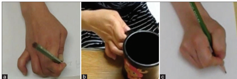
Figure 1: Improvement of the patient's right hand posture over the course of thalamotomy. Writing posture (a) and posture while holding a cup (b) before the surgery. Writing posture after the surgery (c).

Although trauma often precedes the onset of dystonia, its role in the development of dystonia has medical, psychological,