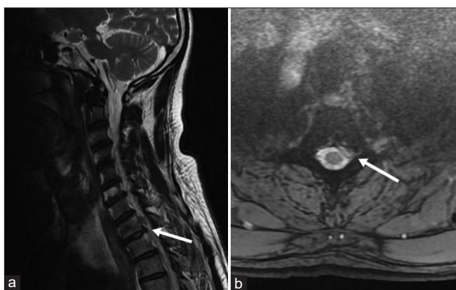
Figure 2: (a) T2-weighted sagittal magnetic resonance imaging (MRI) image of the spine showing T1-T2 disc prolapse (white arrow), (b) T2-weighted axial MRI image of the spine showing a lesion at the left T1 foramen (white arrow).