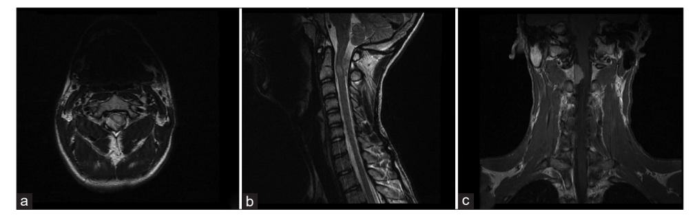
Figure 1: Preoperative magnetic resonance imaging (MRI) scans of Patient No. 1 with neurofibromatosis type 2: (a) Axial T2-weighted MRI with contrast shows a meningioma 23 \times 15 \times 8 mm in size at the C1–2 level. The tumor adheres to the posterior-lateral side of the spinal canal. The meningioma presses and displaces the spinal cord. (b) Sagittal T2-weighted MRI with contrast shows the meningioma and coexisting intraspinal ependymoma sized 11 \times 9 \times 5 mm at the C2 level. (c) Coronal T1-weighted MRI with contrast shows the meningioma before surgery.