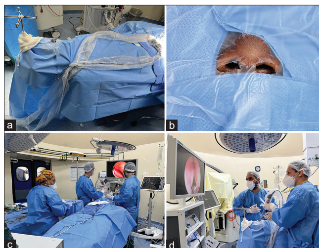
Figure 1: (a) Overview of patient preparation. During the perioperative period, the patient was covered by the nasal and surgical drapes. (b) Nasal drape was used to reduce the nostril. (c) All team members used N95 and surgical cloak. (d) The instruments were inserted through the reduced nostril.

There was one case of COVID-19-related complication: a 15-year-old boy diagnosed with Cushing disease (preoperative cortisol 63.4 µg/dL) was admitted and the magnetic resonance imaging of sella turcica exhibited a right