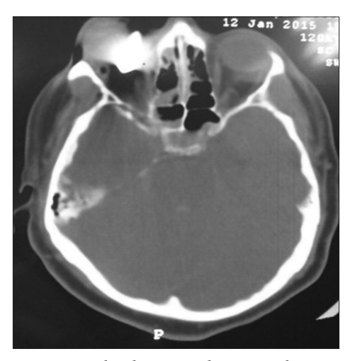
Figure 1: A head computed tomography scan (Axial section) bone window shows a bullet lodged in the right intra-orbital region with possible tract hematoma extending from the right occipital bone.

The patient is transferred to the operating room, where an interdisciplinary team of surgeons is prepared. The surgery