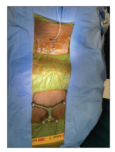
Figure 1: Patient and navigation setup. The patient was placed in the prone position and Ioban was used to secure the navigation reference frame over the thoracic spine.

Postoperative pseudomeningoceles in the setting of CSF leaks and dural tears are the most common complication of posterior fossa decompression for Chiari malformation given the risk profile for CSF leaks is greater than other intradural spine procedures. [6,9] If dural tears and CSF leaks go unnoticed