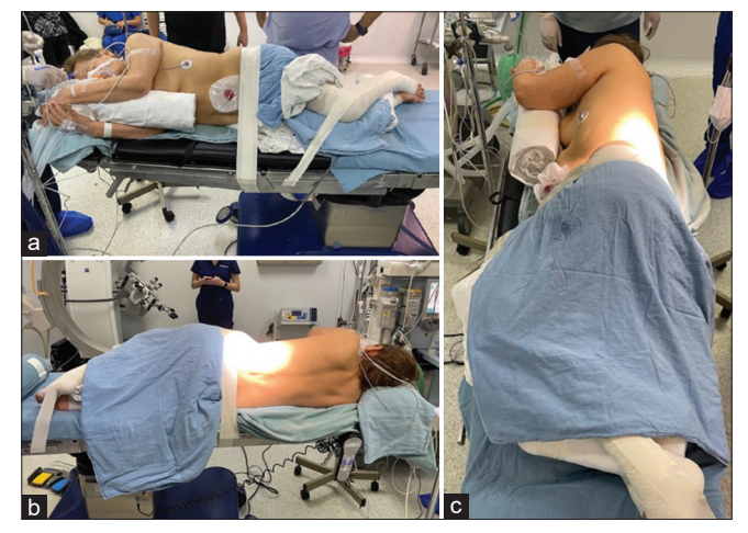
Figure 2: Positioning of the patient in lateral decubitus before starting kyphoplasty. (a) Anterior view showing the presence of a colostomy, (b) posterior view, and (c) lateral view.

A 62-year-old female with a history of osteoporosis treated with teriparatide presented with a 4-week history of falling from a height. When the CT scan revealed a T7 vertebral fracture, she successfully underwent a kyphoplasty performed in the lateral decubitus rather than prone position [Figure 4].