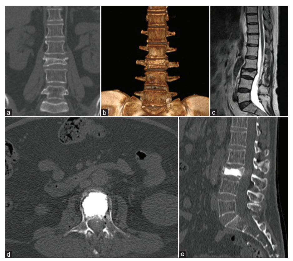
Figure 1: Lumbar tomography in coronal view (a) and 3D reconstruction (b), lumbar MRI in T2 weighting (c), where a L3 vertebral compression fracture is observed. Lumbar tomography in axial (d) and sagittal (e) view after kyphoplasty, with the presence of hyperdensity in the body of L3 corresponding to cementation.

tolerate the prone position, the lumbar L5 kyphoplasty was safely and effectively performed in the lateral decubitus position.