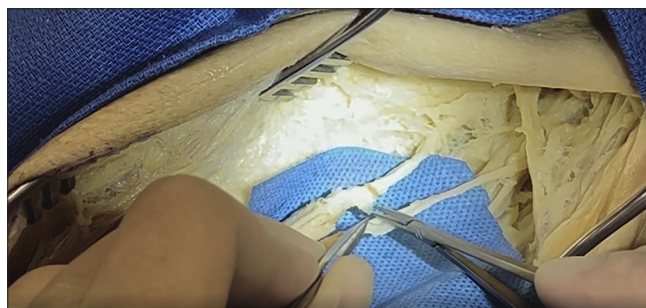
Video 1: Cadaveric nerve transfer demonstrating microsuturing of the tibial nerve to the vastus medialis nerve.

The three sciatic nerves that did not achieve successful coaptations were transected too distally. Specifically, the sciatic nerves in the first cadaver were transected at the mid-thigh level and failed to reach the VM and VL branches without an interposition graft. Transecting at the gluteal fold, a more proximal site, provided the necessary length. The transfer in cadaver 4's right extremity resulted in an above-average PN to VL overlap with 9 cm but did not provide any overlap in the TN to VM coaptation.