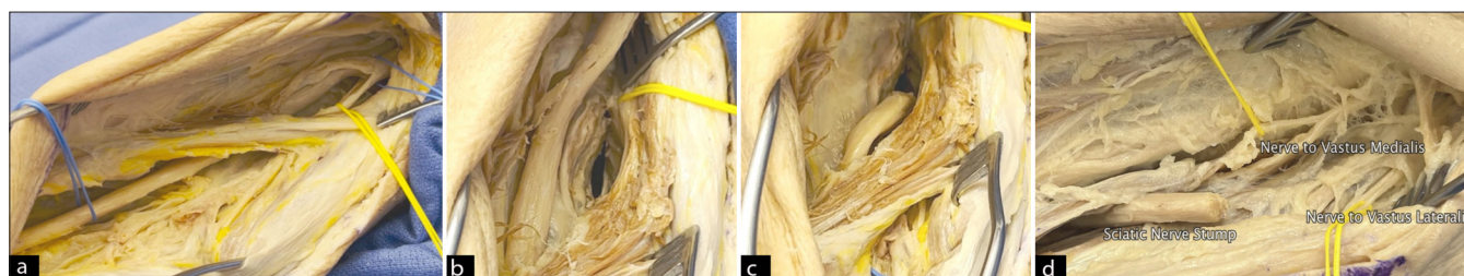
Figure 2: (a) Posterior midline incision is performed in the thigh to expose the sciatic nerve, tagged in blue loops, and the hamstring branches, tagged in yellow. (b) The muscular window was created through the adductor magnus. (c) The sciatic nerve was then disconnected and transferred through the adductor magnus window toward the anterior compartment of the thigh. (d) Anterior view of the lower extremity. The sciatic nerve is near the labeled vastus medialis and vastus lateralis nerves tagged in yellow.

In total, 7 of the 10 lower extremities displayed successful coaptation following the nerve transfer [Table 1]. A transfer was deemed successful if the overlap value was >0 cm to ensure tensionless coaptation. Cadavers 2–5 received